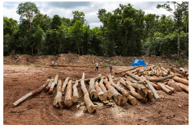
Soft wood trees in Mexico that have been selectively harvested to use in toothpick production.

Students use Google Earth to compare forests that have been logged selectively with those that have not. For an outdoor activity, students create a comprehensive list of all the tree species in their study area.